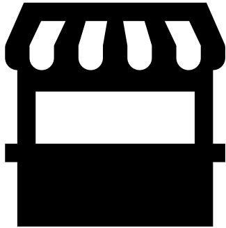
De Wei's Bookstore